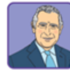
King Charles III