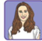
Princess of Wales