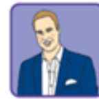
Prince of Wales